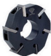
標準配備(刀頭2個) Accessory (Cutter 2pcs)